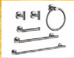
Bathroom Hardware Set (Brushed Nickel)