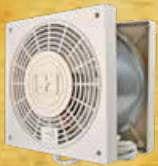
Room to Room Air Exchange Fan