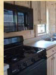
30" Range & Microhood