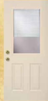
Door with Internal Window Blinds