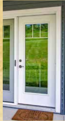
Legacy Steel Patio Door