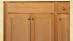
Stained Kitchen Cabinets