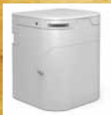
Ogo Composting Toilet