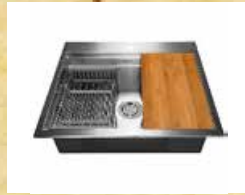
Stainless Steel Workstation Sink