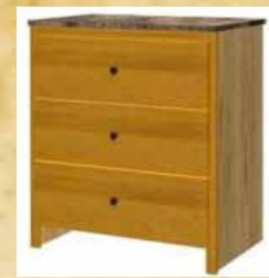
Chest of Drawers 3 drawer (31x34x19¼)