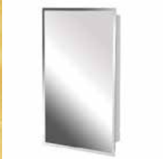
Bathroom mirror/ Medicine cabinet