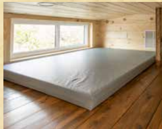
5" Loft Mattress (Single, Twin, or Queen)