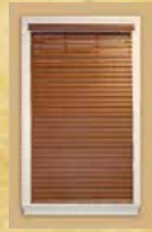
Faux Wood Blinds Depending on model