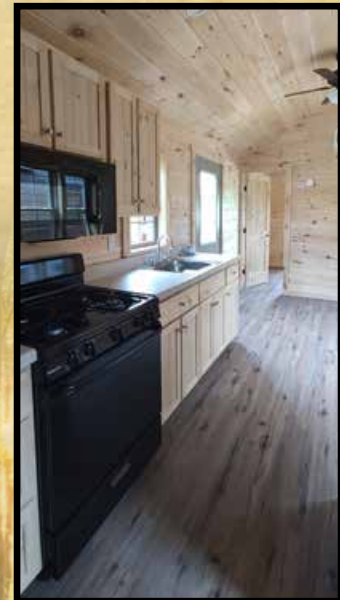
FOREST GLEN 11' x 36' Cabin, Sleeps 6-8, Bathroom, Kitchen, 2 Private Bedrooms / Bunkrooms, Large Living / Dining Area, Optional Loft.