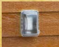
Exterior Electrical Receptacle