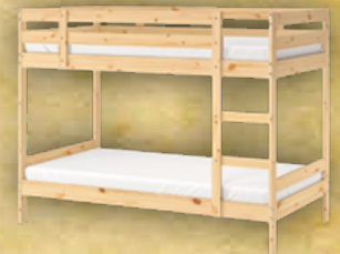
Bunk Bed Frame