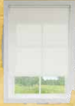
Roller Shades Depending on model