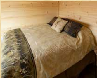
Queen Size Mattress