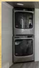
Prep for Washer and Dryer