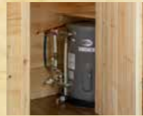
Propane Appliances and Water Heater