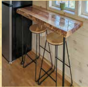
Modern Rustic Bar