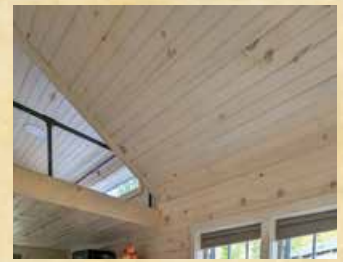
Interior Finish (Whitewash)