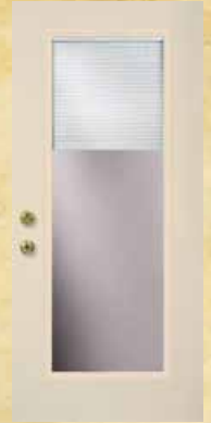
Internal Patio Door Blinds