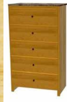
Chest of Drawers 5 drawer (31x53x18)